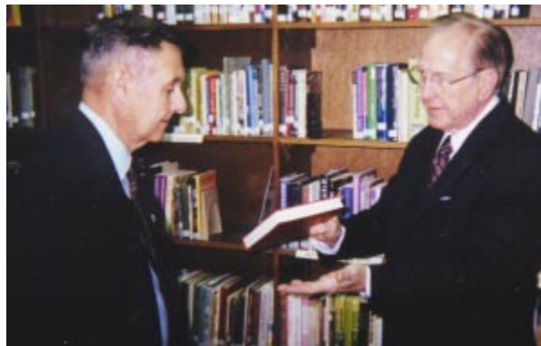
8. Christ voluntarily took our sin upon Himself. (I Pet. 2:24)