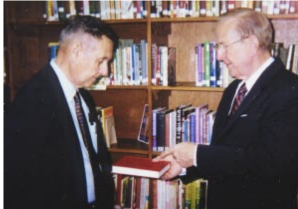
6. If we pay for our sin, we will have to pay for it by death and hell. (Rom. 6:23)