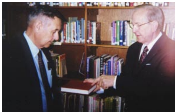
2. Let this represent sin. We all have sin on us. (Rom. 3:23)