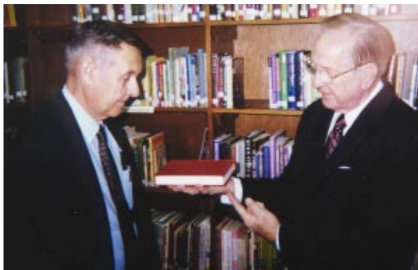
3. God loves us. (John 3:16)