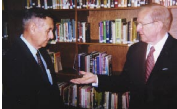
1. Let this hand represent you and me.

The "visual aid" gesture, pictured step-by-step below, has been found EXTREMELY VALUABLE in making the plan of salvation clear and understandable to the lost - especially on the point that the Lord Jesus Christ has made a complete payment for sin.