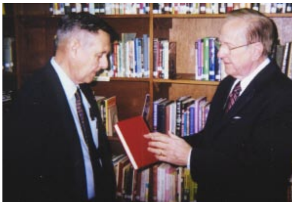
5. Our sin separates us from God. We cannot get rid of our sin by our good works. (Isa. 59:2; Eph. 2:8, 9)